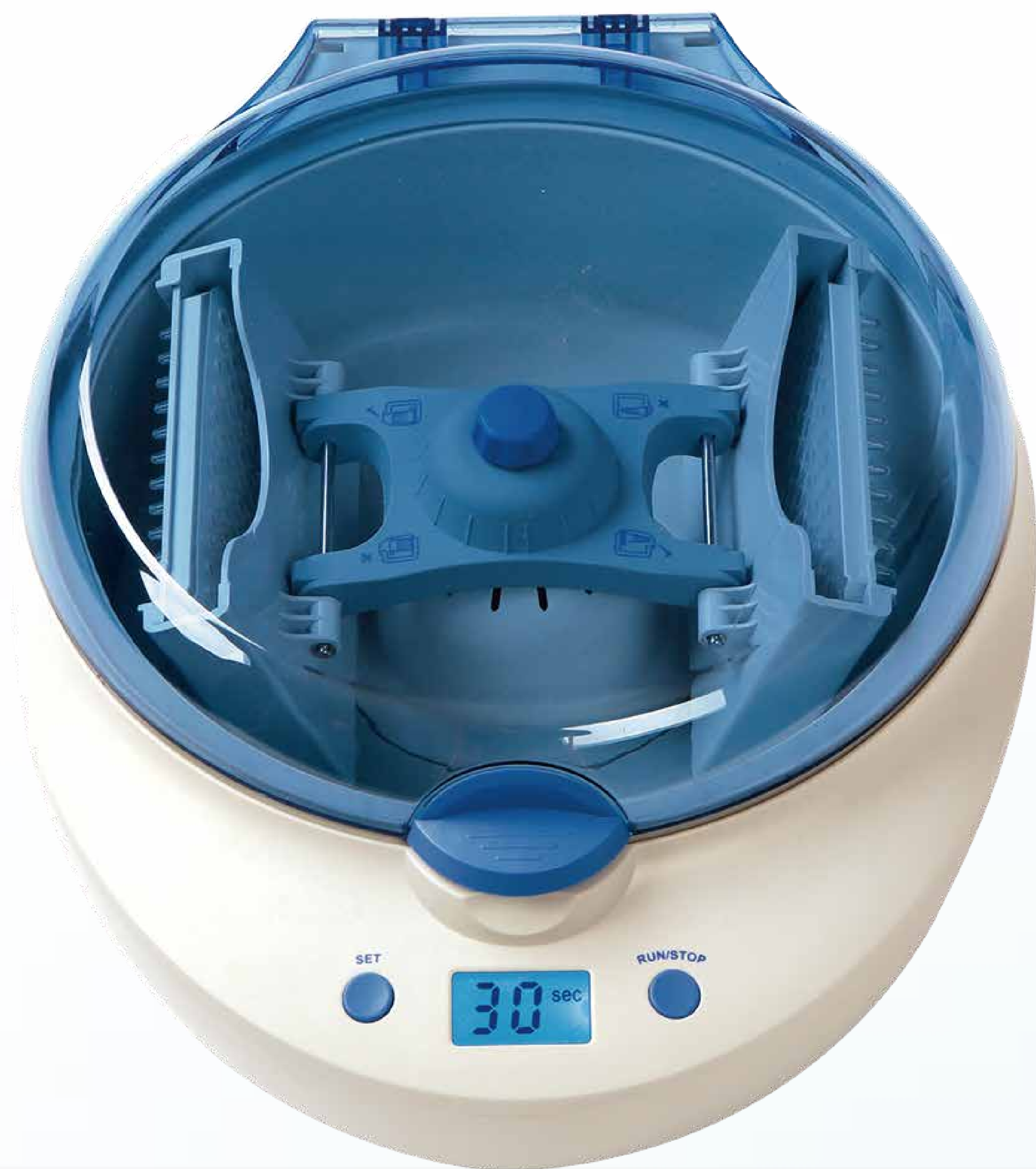
Before & After Centrifugation